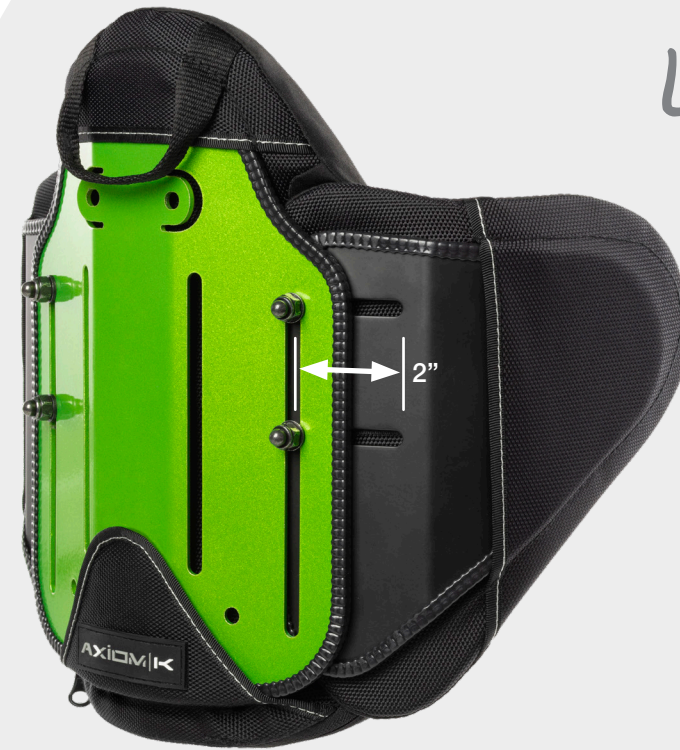
AL Back with contoured laterals