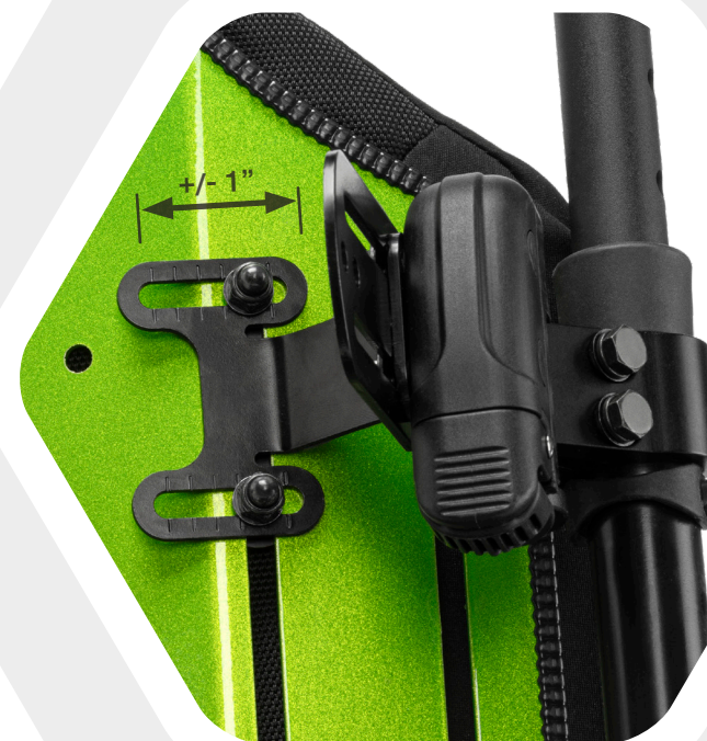
DEX for Kids

Setup and growth is easy with intuitive depth and angle adjustments, along with the ability to fit chair widths +/- 1". With three models and three lateral options - Axiom for Kids is the most versatile range of pediatric back solutions on the market.