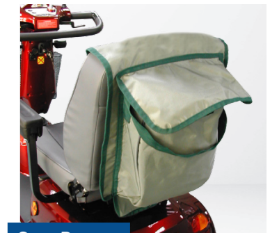
Seat Bag for with no Headrest Scooter Series 5 and 8 only