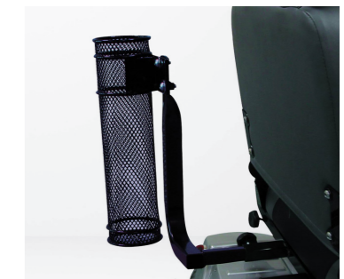
Cane Holder Scooter Series 5/6/7 and 8