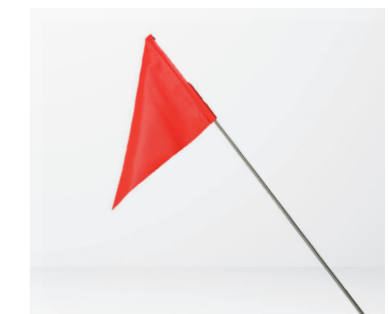
Safety Flag Scooter Series 5-8