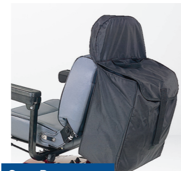
Seat Bag for Seats with Headrest Scooter Series 5 and 8 only