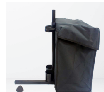
CTM Large Rear Bag Scooter Series 5/6/7/8 and HS-928