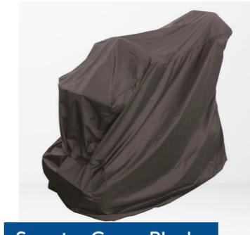
Scooter Cover Black Scooter Series 5/6/7/8