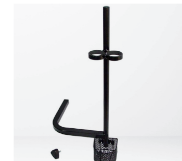
Crutch Holder Scooter Series 5-8 and 9