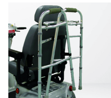
Walker Holder Scooter Series 3/5/6/7 and 8