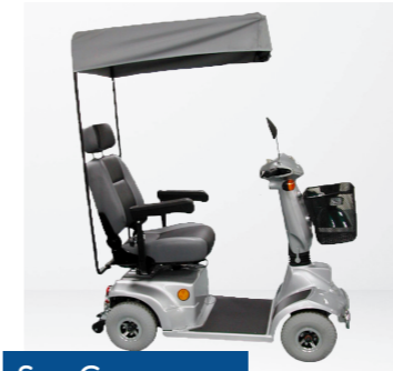
Sun Canopy Scooter Series 5/6/7/8 and 9