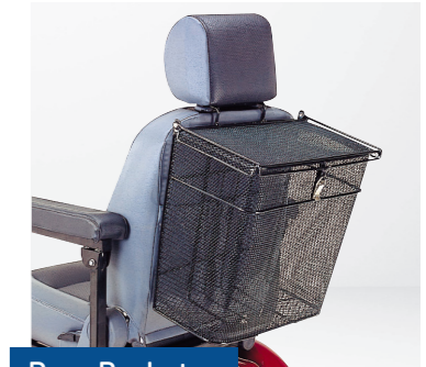
Rear Basket for Seats with Headrest CTM range of Powerchairs