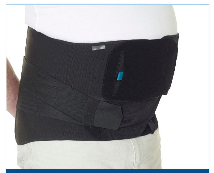
Selection Back Wide