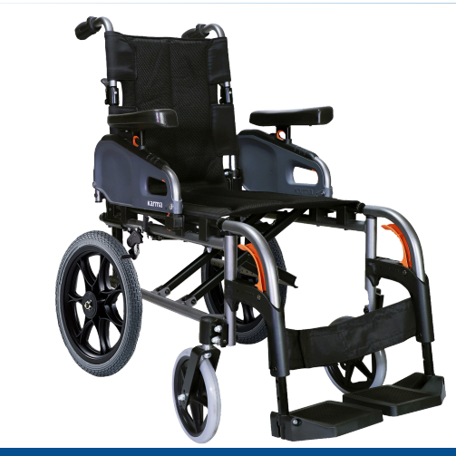
Karma Flexx HD Transit Wheelchair

Chrome polish finish steel frame. Detachable full armrest. Folds for easy transport. Some assembly required.