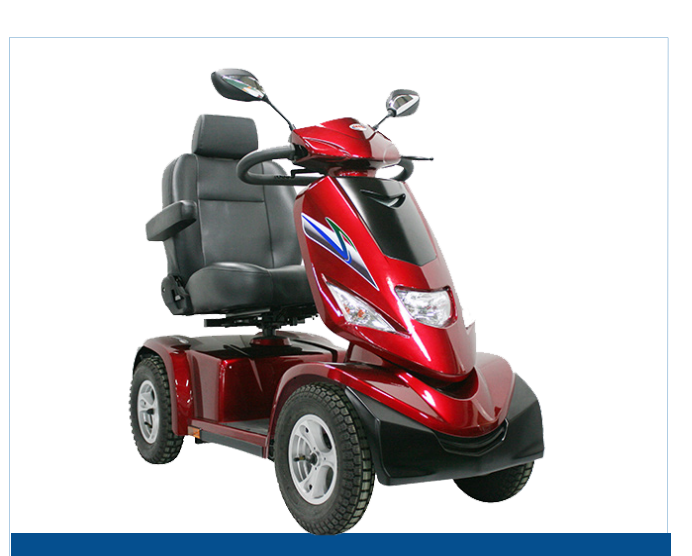
HS-928 Mobility Scooter

Weight capacity of 204 kg, with or without power tilt. Heavy-duty seating with seat width from 20" - 32". Standard seating with seat width from 12" - 24" with easy adjustment.