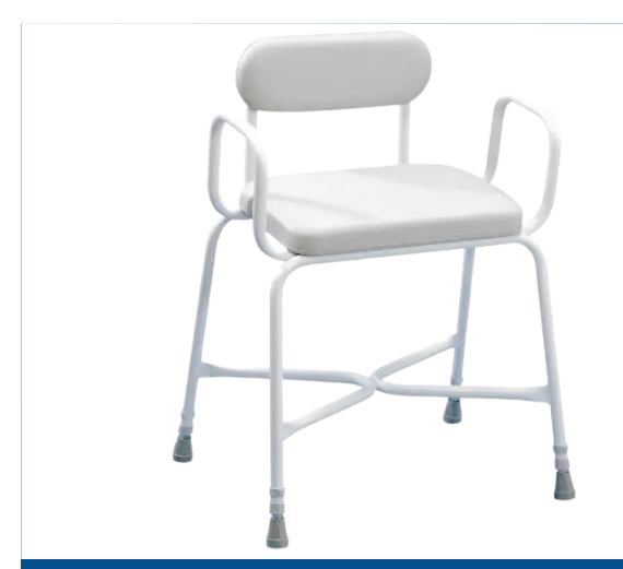
Bariatric Perching Stool with Arms & Backrest

It has extra stabilizing straps that "cross-over" in the back. Measurement at Hip: 1250-1400 mm for XX-Large 1400-1600 mm for XXX-Large