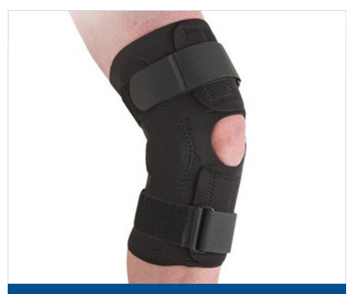
Ossur Wraparound Hinged Knee Support