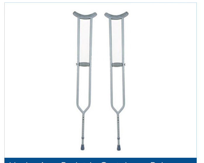
Under Arm Bariatric Crutches - Pair