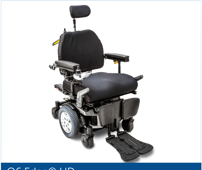
Q6 Edge® HD