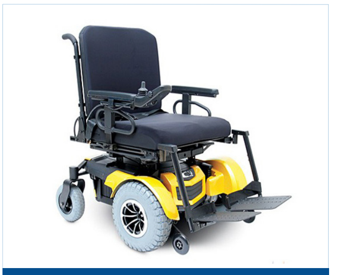
Quantum® 1450 Powerchair

Colours: red or blue Maximum user weight: 226 kg Maximum speed: 15 kg