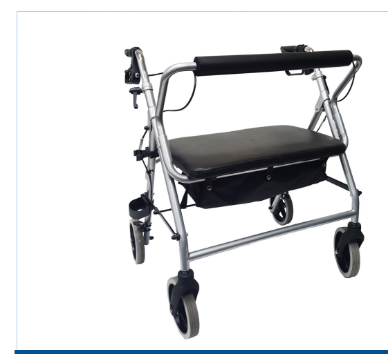
Rollator - Bariatric 8" Wheel

Suitable for users up to 540kg Suitable for toilets with seat fixing centres of 130 – 140mm Made from durable, high-impact ABS plastic Easy to install and clean