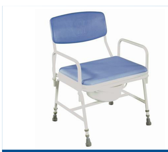
Belgrave Bariatric Commode / Shower Chair

17" - 18" for XX-Large; 18" - 23" for XXX-Large