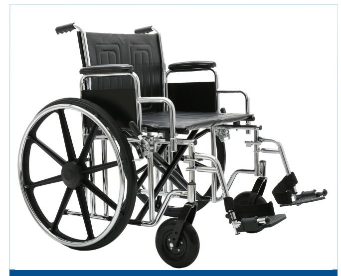
AML Wheelchair Self-Propelling Bariatric

Folds for easy transport. Some assembly required.