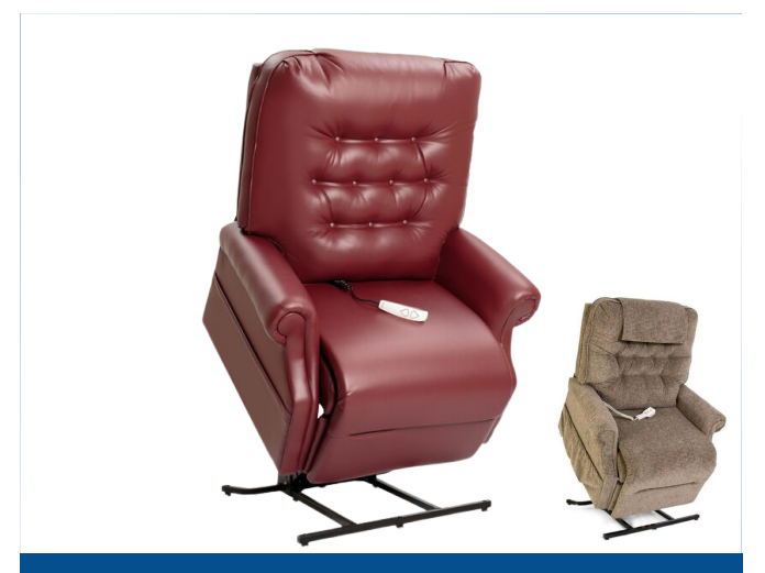
Pride Power Bariatric Lift Chair

Completely latex free Height from handle for floor: 1575 - 1778 mm