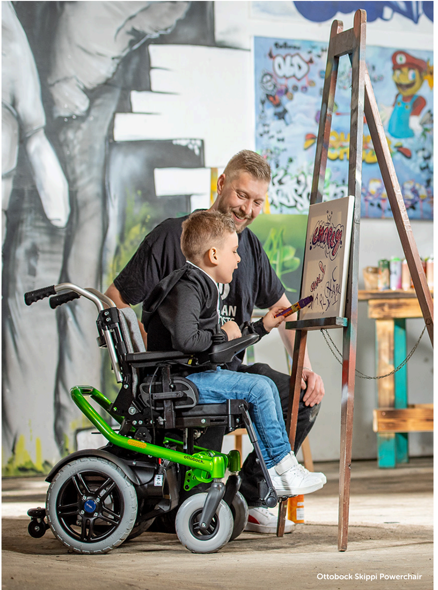
Ottobock Skippi Powerchair