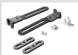
HW100-150-2 Short (150mm/6") Strap Guides

* Standard fasteners compatible with most backrests. For Permobil Corpus chairs, order the HW101P Fastener Pack, sold separately.