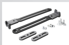
HW100-200-2 Long (200mm/8") Strap Guides

Available in two lengths to accommodate different backrest sizes and shapes. Sold in pairs with complete M6 fastener kit* and spacers (to accommodate wrapped upholstery or edge trim).