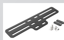
HW105L-1 Large Mounting Adapter

Sold separately, with M6 fasteners and nut plates for harness attachment.