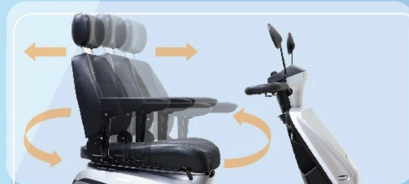
Back Sliding Seat