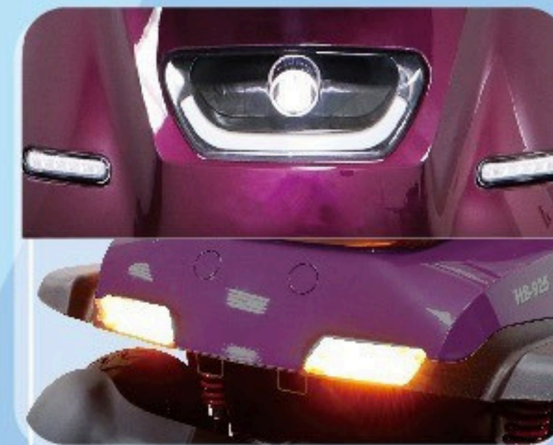
LED Lighting Package & Daytime Running Light