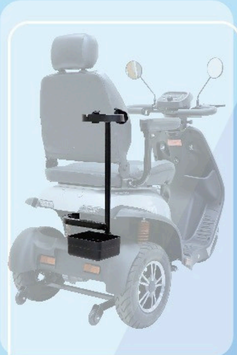
Cane and Crutch Holder