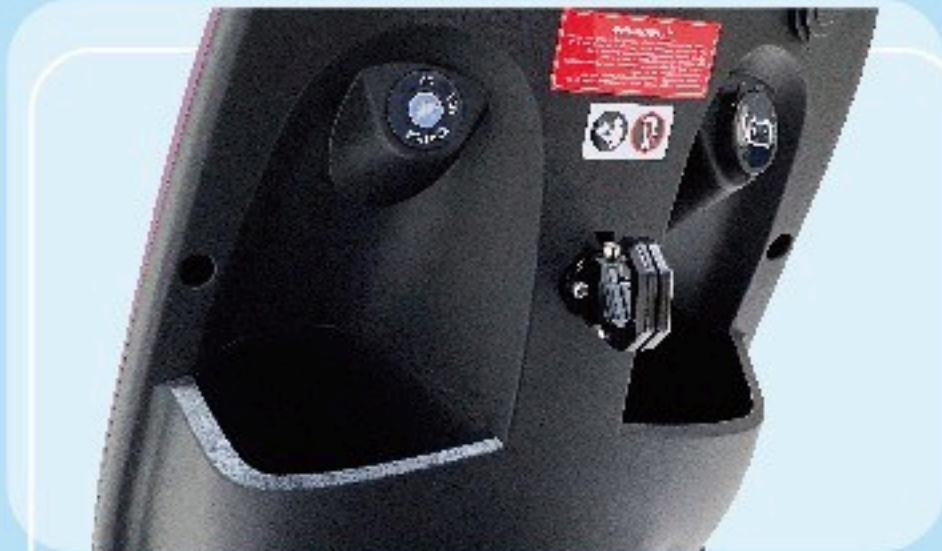
Storage Compartment and Hook