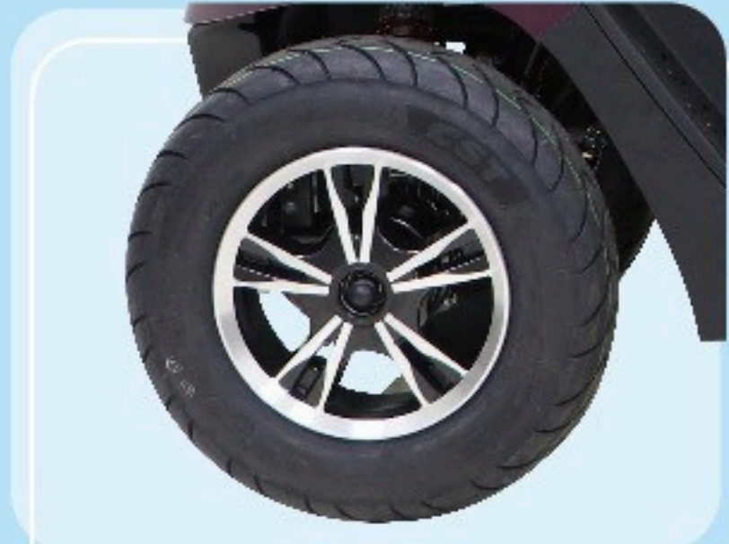
15" Large Wheels