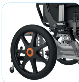
For the Attendant Propelled set up, the rear wheel diameter is 16".