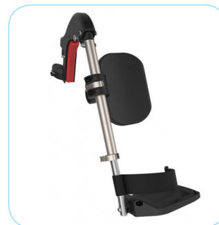
The wheelchair is equipped standard with length adjustable elevating legrests.