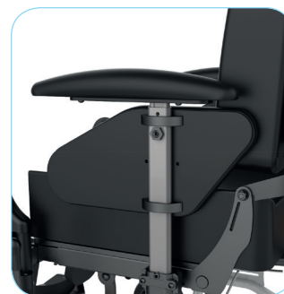
Height adjustable armrest in a range of 27 – 40 cm.