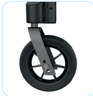
Front wheel options include puncture proof PU in 6", 7" and 8" diameters at multiple positions in the front fork.