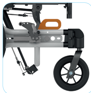
The wheel base can be extended at the front by 5 and 10 cm.