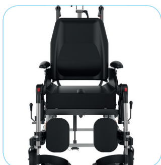
Frame sizes for best fit: 32, 36, 41, 46, 51, 56 and 61 cm.