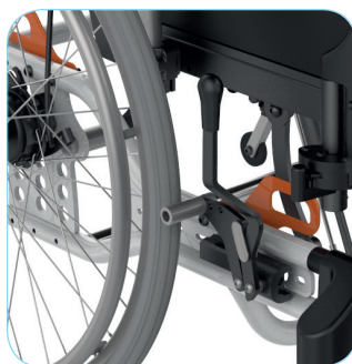
Brake options include attendant drum brakes and knee brakes with short or long lever.