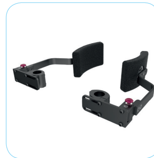
Lateral supports as an option.