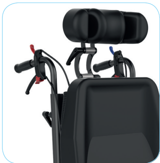
The wheelchair is equipped standard with height adjustable push handles and multi-adjustable head rest.