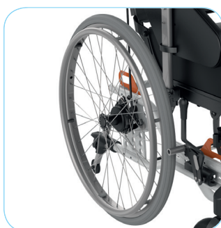
The chair can be set up as Self propelled with 20", 22" and 24" rear wheels.