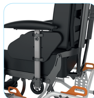
4-point tie down system for transport and securing the wheelchair in a vehicle.