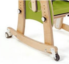
Skis with castors