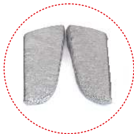
seat minimizing kit