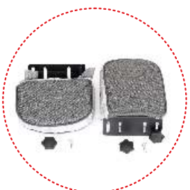
head / torso adjustable pads