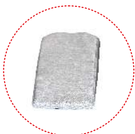
seat minimizing kit