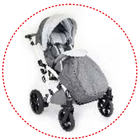
winter sleeping bag