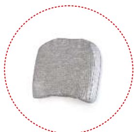
seat minimizing kit