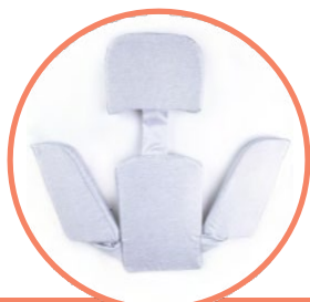
SET MINIMIZING KIT