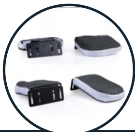
HEAD/TORSO ADJUSTABLE PADS