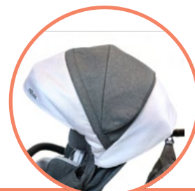
CANOPY WITH WINDOW