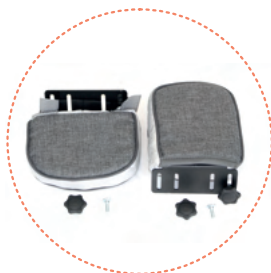
head / torso adjustable pads