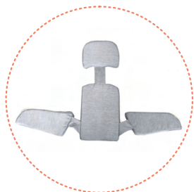
seat minimizing kit