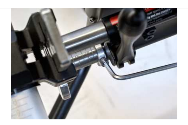
9. Insert the locking rings towards the centre of PAWS and lock them in place. This means that the entire attachment unit will be in the correct position when, for example, you have removed them carrying PAWS in the car.