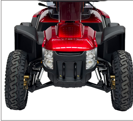
13.3 cm Ground Clearance