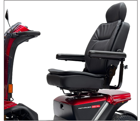
High Back Pillow Top Seat