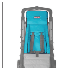
Seat inlay (seat size reduction)