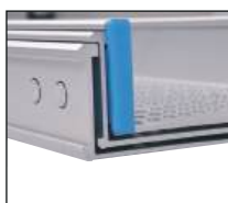
Plastic sliding bearings to ensure smooth operation