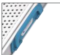
Ergonomic carrying handle on both sides