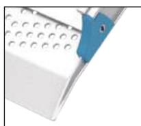
With a non-slip and perforated surface