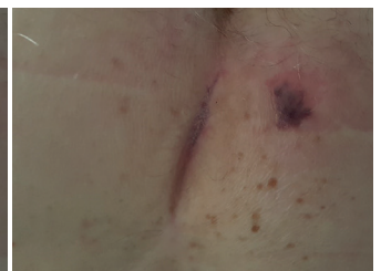
Figure 5: Red area in August 2018