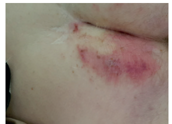
Figure 1: Red area at the start of the trial

His occupational therapist wanted to investigate cushions which could provide robust postural support but would be light weight, easier to maintain and provide the best pressure care.