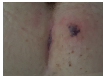
Figure 4: Red area in July 2018 (approximately 10 days after the start of the trial)

"The Vicair seating trial has gone extremely well showing a marked improvement over my current Jay Active. Of particular note is a fading of the dark patch and general skin colour improvement over a relatively short period of around 10 days (see attached comparison photos)."