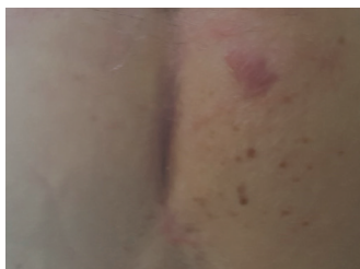
Figure 6: Red area in September 2018

Given I was up and about the day after surgery I was feeling a bit fragile and unable to perform normal pressure relief regime. The Vicair appears to have given the needed protection even though my movements been greatly reduced...I'm extremely happy as you can imagine, attached pics show botty day before surgery and last night!"