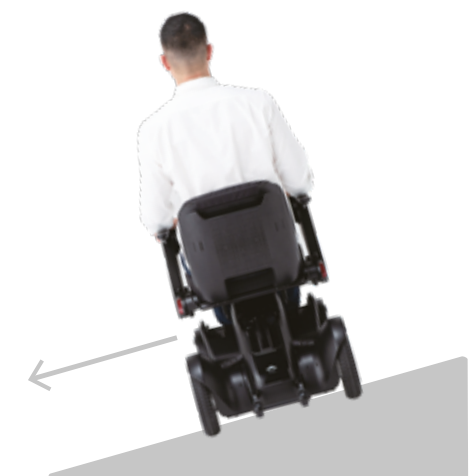
The WHILL Model C2 is designed to prevent drifting. Drive straight on a tilted path.