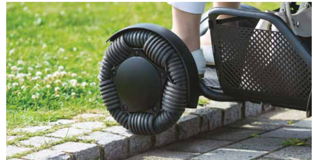
Effortlessly negotiate obstacles up to 5 cm high.

Thanks to its two powerful motors and innovative wheels, the WHILL Model C2 can be used on terrain that a standard wheelchair can't handle. Holes in the road, uneven terrain, grass and gravel will no longer be an issue.