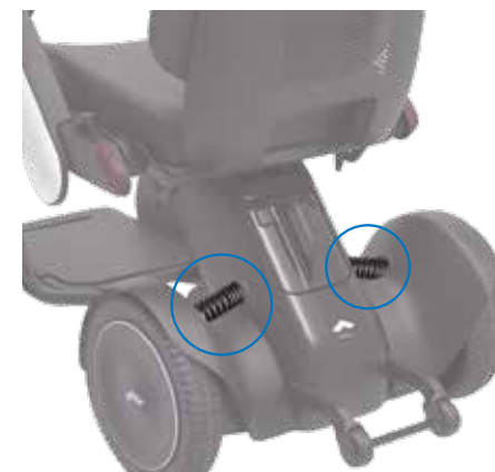
Rear wheel suspension absorbs the impact when driving over bumpy roads or obstacles.