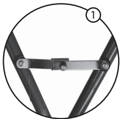
Folding mechanism (in lock position)