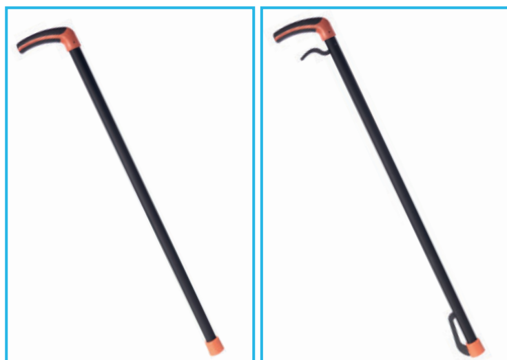
Freestyle Walking Stick

The Freestyle Grab & Go and Freestyle Walking Sticks have been designed to enable comfort and support while walking or manoeuvring from one place to another. The Grab & Go Walking Stick has the additional benefit of the grabber feature to enable the retrieval of light to mid-weight items, such as keys, wallets and glasses.