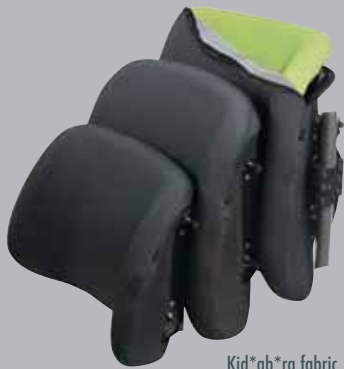
Kid*ab*ra fabric optional